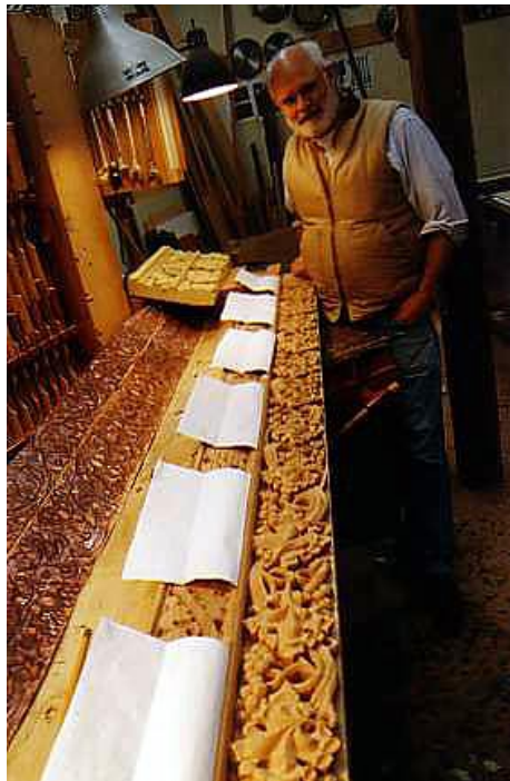
Carving the replacement upper beam of the rood screen at Agrell Architectural Carving in California. Photographs and a polyurethane casting of a section of original beam (to the left of the carver) serves as the model.