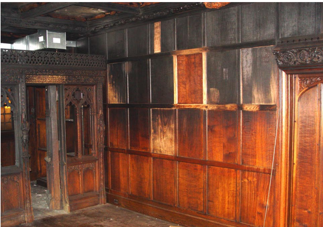
Tests proved that charred flat surfaces, such as the damaged wainscot above, can be scraped, toned and coated to match undamaged original oak.

I received calls the day after the fire from Stacy Rusch, the