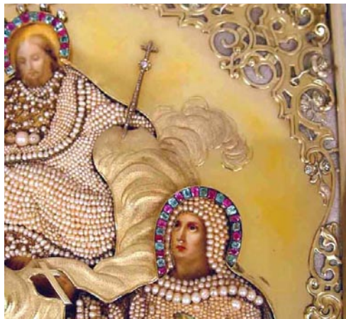
Detail of a 19th-century Russian icon before and after conservation. Highly acidic aerosol smoke residues (below pH 6) and particulates caused the oxidation. The icon is composed of an oil panel painting, a linen/silk overlay embroidered with natural seed pearls, a parcel gilt cover plate, gilt lipped trim, and four semi-precious stone diadems. This icon is one of many composite decorative art objects treated by Amy Fernandez.