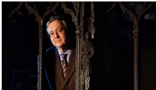
The rood screen as it appeared after the 2003 fire. The lighter-colored areas at left resulted from surface cleaning to determine the extent of charring.

to remove the damaging soot, including steps necessary to stabilize or strengthen objects to withstand cleaning. The obligation results in an unexpected benefit to the Hermitage Foundation Museum: many objects will be in a better state of preservation after treatment than they were prior to the fire.