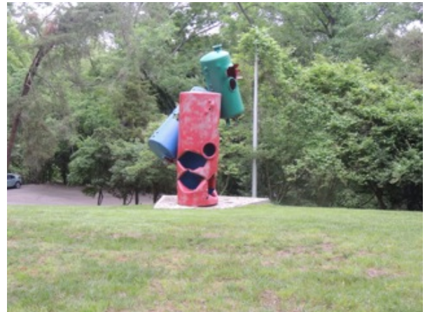
Modern sculpture are on the grounds.