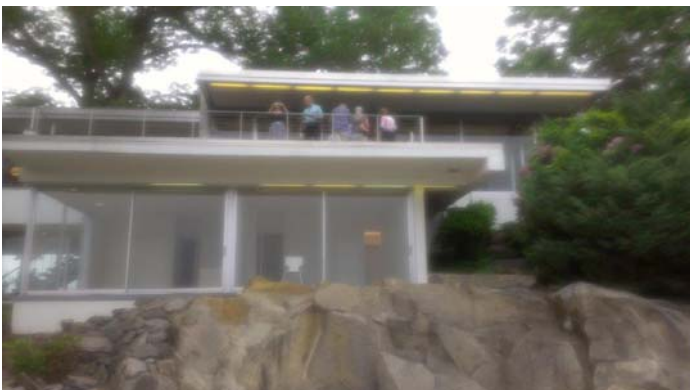
Rice House was designed and built by architect Richard Neutra. The Science Museum changed some elements for safety and is working to complete exterior landscape per the original design.