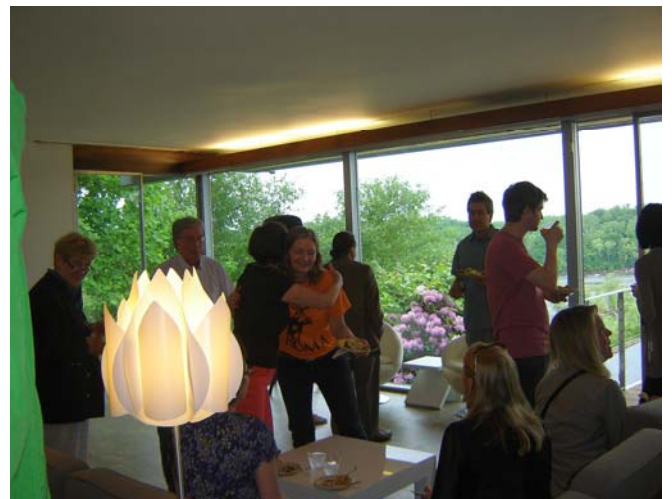
Rainy weather promoted indoor socializing. Mosaic catered the event.