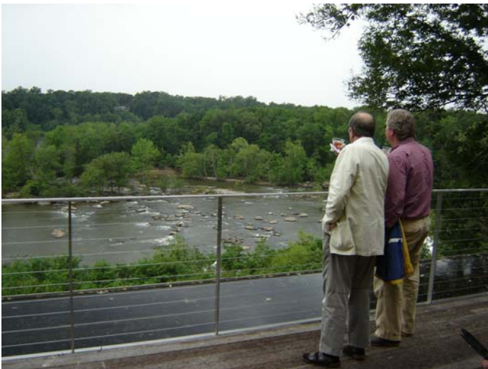
The house is on Lock Island, overlooking the James River.