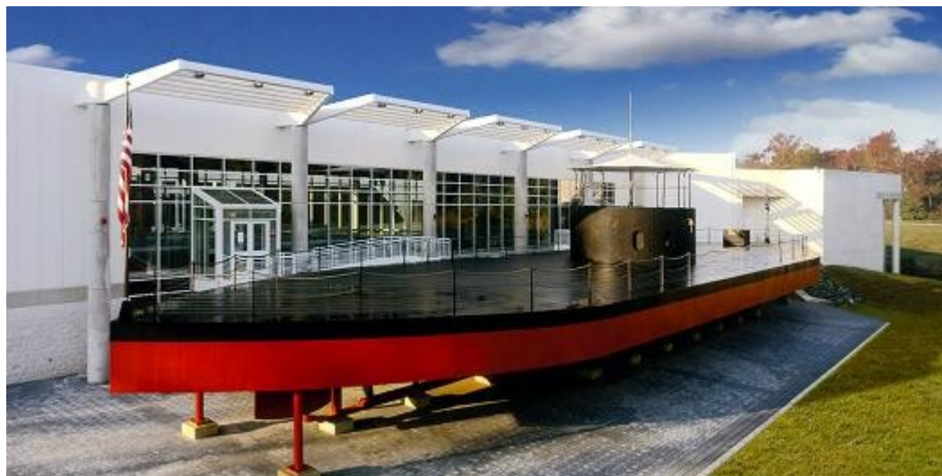
An exhibit for the USS Monitor at the Mariner's Museum