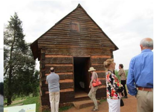
One of several reconstructed cabins that housed Monticello's slaves. This one was used by members of the Hemmings family.