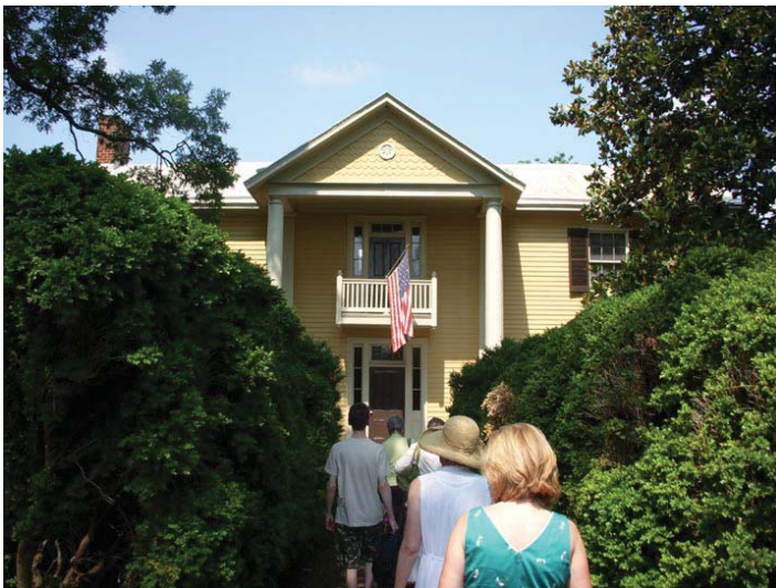
(above) VCA Members on the boxwood walk (below) James Monroe by Attilio Piccirilli, ca. 1897.