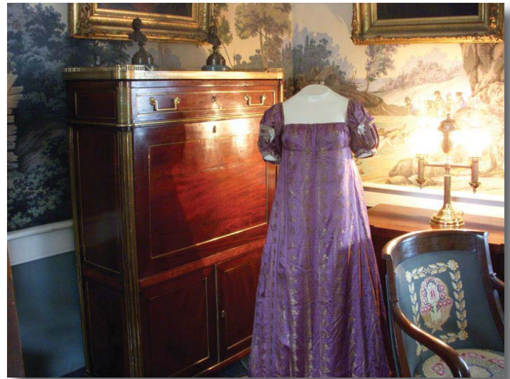
(above) French Purple Silk Brocade Evening Dress, ca. 1815 in the Monroe Drawing Room.