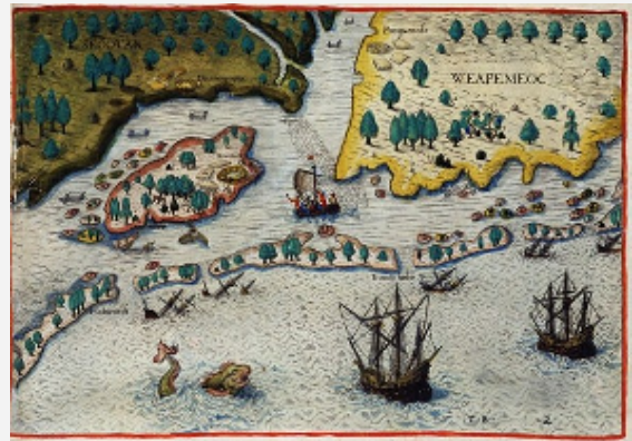
Theodor DeBry, Anglorum in Virginiam Aduentus, from Admiranda Narratio, 1590. The Mariners' Museum Library Rare Book Collection.

THE MARINERS' MUSEUM 100 MUSEUM DRIVE, NEWPORT NEWS, VA