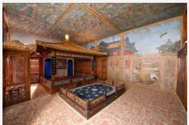
Above: Qianlong's private retreat.