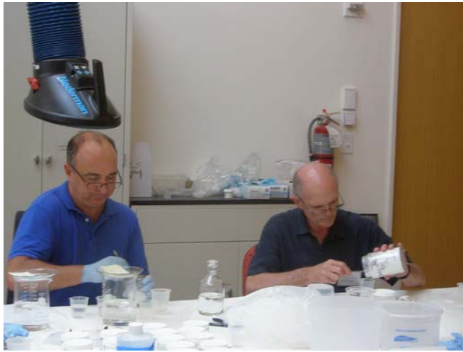
Lab sessions involved making simple and complex stock solutions that were tested on various objects. The testing parameters were entered to the MCP Computer Database, which guides the conservator in creating more optimized cleaning solutions, for more precise treatments.