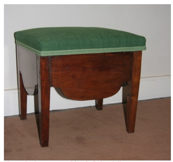
Commode after treatment.

intrusive upholstery system was subsequently installed by the upholstery conservator, and the commode is now on view at Monticello in one of the recently re-interpreted second floor spaces.