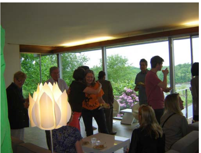
Rainy weather promoted indoor socializing. Mosaic catered the event.