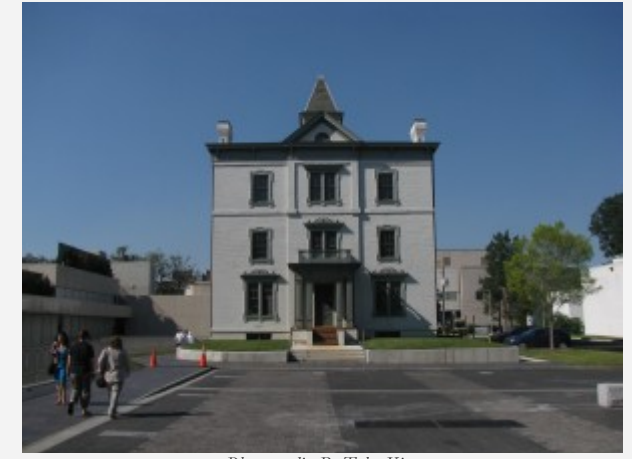
VIRGINIA MUSEUM OF FINE ARTS 200 N. Boulevard Richmond, Virginia, 23220

VCA Members' Meeting Thursday, September 18<sup>th</sup> 5:30 p.m.