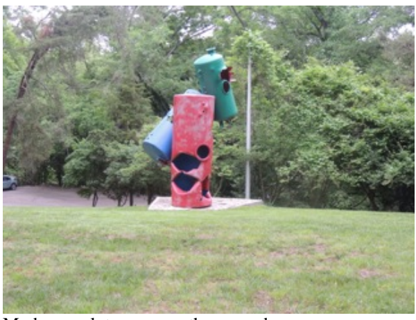
Modern sculpture are on the grounds.