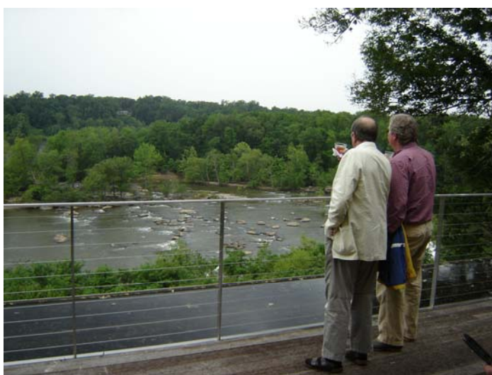
The house is on Lock Island, overlooking the James River.