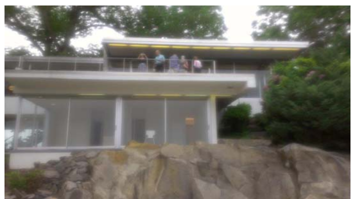
Rice House was designed and built by architect Richard Neutra. The Science Museum changed some elements for safety and is working to complete exterior landscape per the original design.