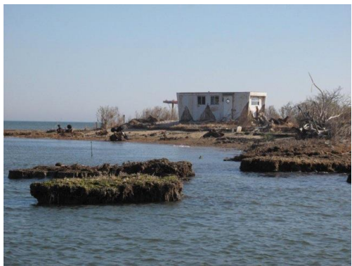
Uppards, Tangier Island

The Dove of Peace weathervane at Mount Vernon was a special order for George Washington and has been on the Mansion for over two hundred years. In 2007, the movie "National Treasure 2" was filmed at Mount Vernon. The film crew used a large crane to inspect the weathervane, which showed it clearly needed conservation. The project was completed in 2008.