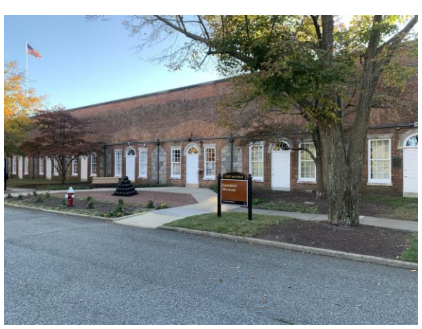
Fort Monroe and the Casemate Museum.

Location: Fort Monroe and Casemate Museum