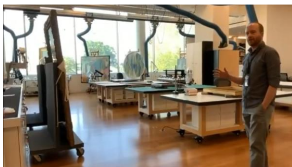
Screenshots from the virtual tour of the VMAF conservation lab