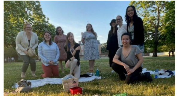
ECPN members met in person on Colonial Williamsburg's Palace Green in the spring

https://www.facebook.com/groups/419707523031/