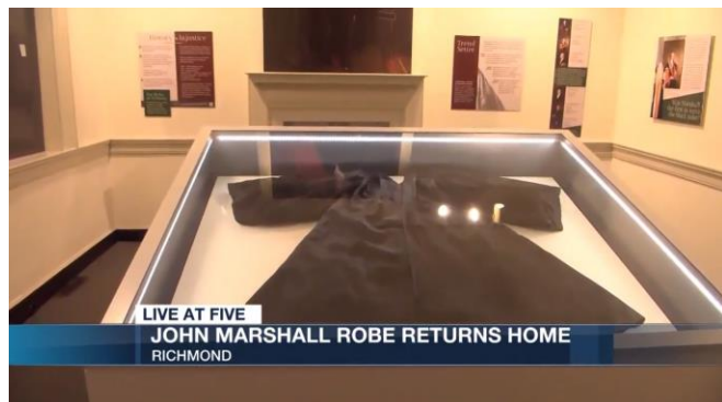
Reinstallation of the robe received local media attention.

The first project centered on the stabilization of Supreme Court Justice John Marshall's robe, in the collection of the John Marshall House and Preservation Virginia. The robe had seen more than five previous campaigns of intervention, ranging from densely packed darning stitches in human hair to stitched silk crepe patches. Howard's treatment aimed to stabilize the fragile silk so the robe could be displayed in a custom-made case upon its return to Virginia. The robe underwent overall humidification before receiving a stitched support lining of black silk organza and a custom interior support. The project also included the creation of three replica robes that will enrich interpretation at the site. The robe is currently on display at the John Marshall House in Richmond.