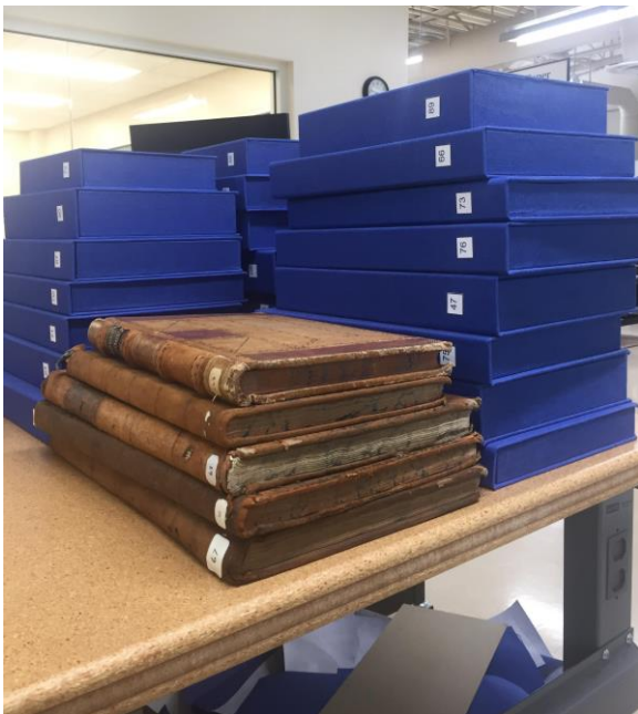
A stack of logbooks awaiting rehousing next to a stack of completed boxes.