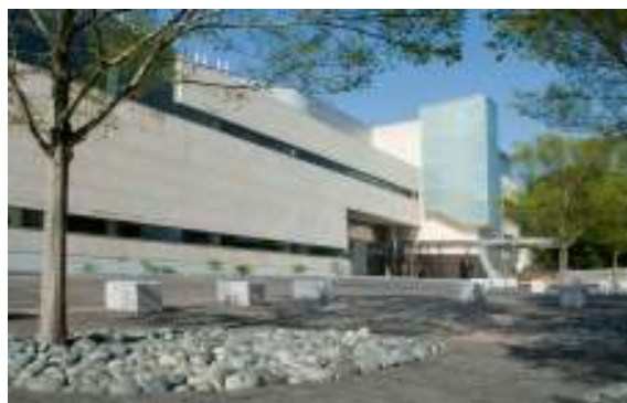
Virginia Museum of Fine Arts

Next VCA Members' Meeting: Thursday, January 20 th , 2011, 5:30 p.m. Virginia Museum of Fine Arts ~ meeting place TBD 200 North Boulevard, Richmond, VA 23220